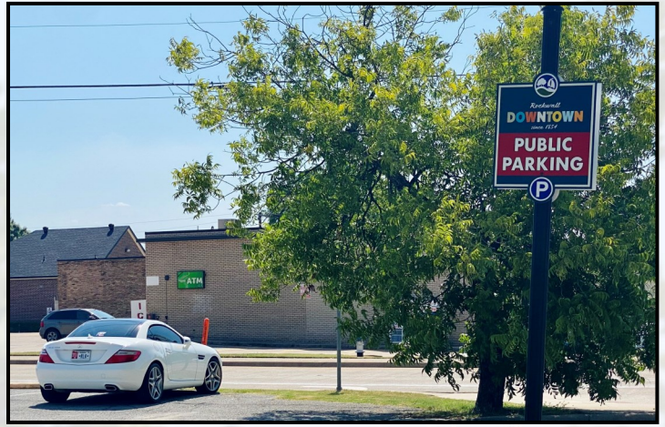
New Parking Signs Installed in Downtown

The Rockwall Fire Department's annual Junior Fire Academy is once again a success with students. Every year the FD plans an educational and fun-filled week for boys and girls ages 10-12. This year the event was expanded to two separate weeks to accommodate more students. The youths geared up like their grown-up counterparts and went to work to learn about what it takes to be a firefighter, even including a tour of a helicopter.