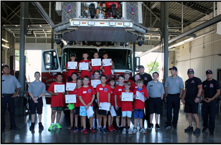
Junior Fire Academy Graduates Young Cadets

The Rockwall Fire Department's annual Junior Fire Academy is once again a success with students. Every year the FD plans an educational and fun-filled week for boys and girls ages 10-12. This year the event was expanded to two separate weeks to accommodate more students. The youths geared up like their grown-up counterparts and went to work to learn about what it takes to be a firefighter, even including a tour of a helicopter.